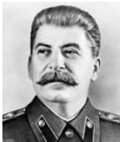
Stalin - USSR